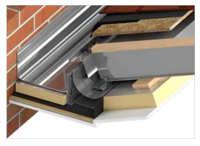
Box gutter assembly designed for easier installation, better looks and improved performance