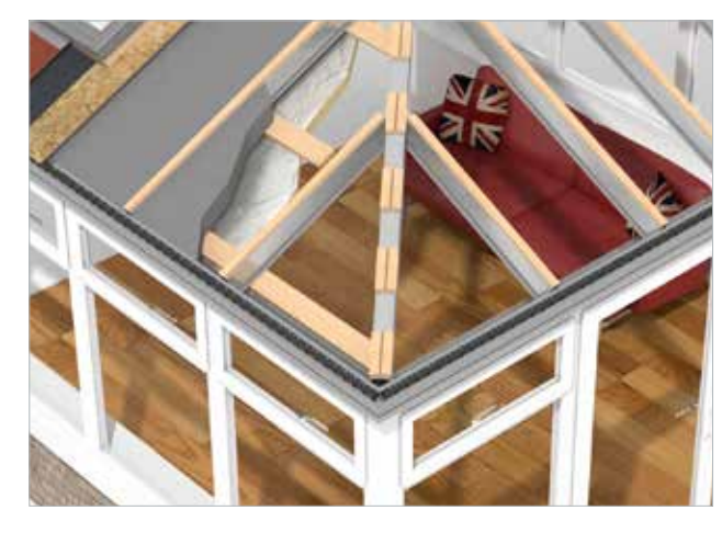
Fully ventilated roof system now with extra rigidity