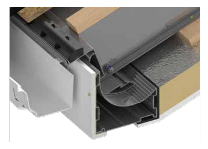
New 15° and 25° fixed pitch options allow for simpler roof designs (Variable 5°-35° pitch shown)