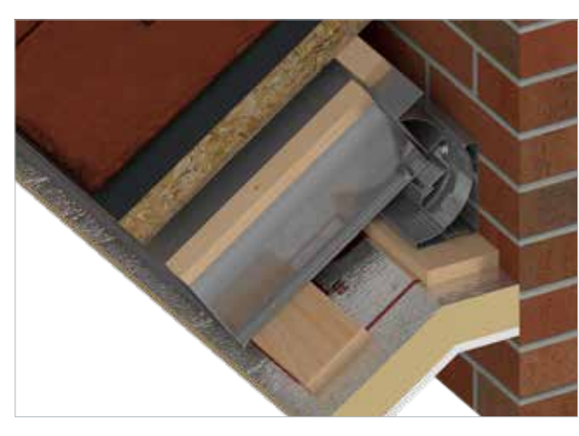
Variable and fixed pitch wall plate assembly options offers flexibility