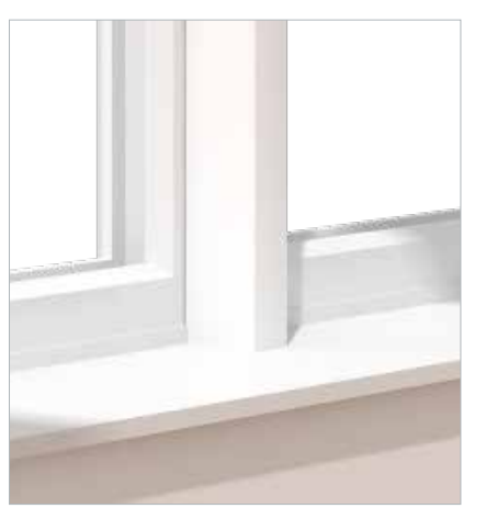
Structural Support mullions capable of holding the full weight of an Equinox roof system, where frames are not adequately reinforced

*Excludes internal finishing, frame fixings and wall side fixings